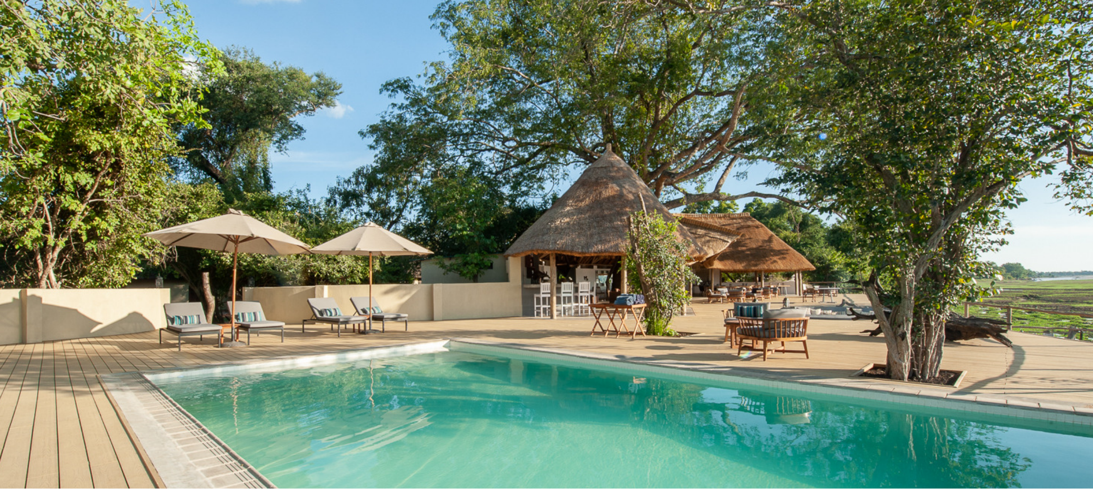
THE STUNNING POOL AREA & ROOMS AT KAFUNTA RIVER LODGE