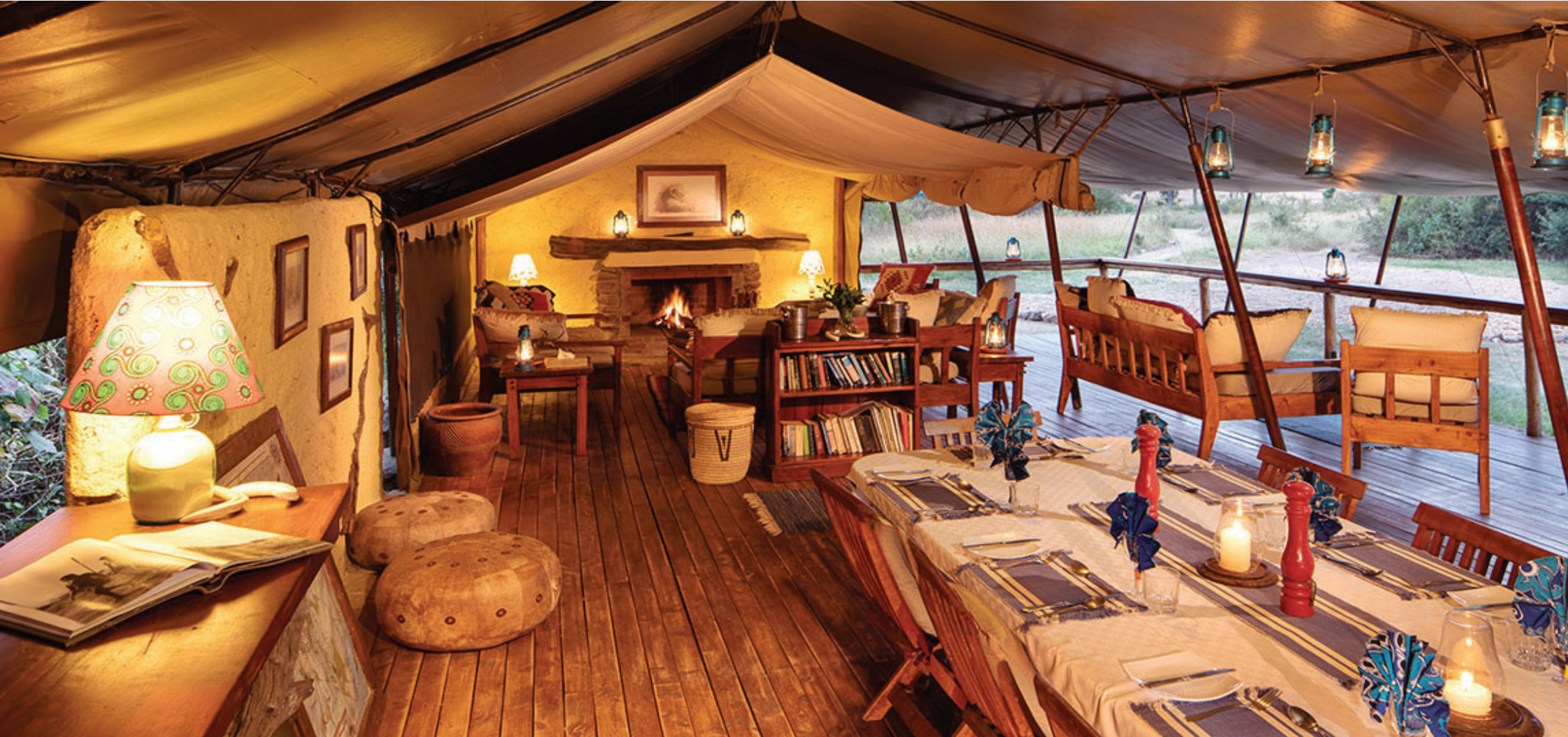
THE BEAUTIFUL DINING AREAS AROUND THE OFFBEAT MARA CAMP